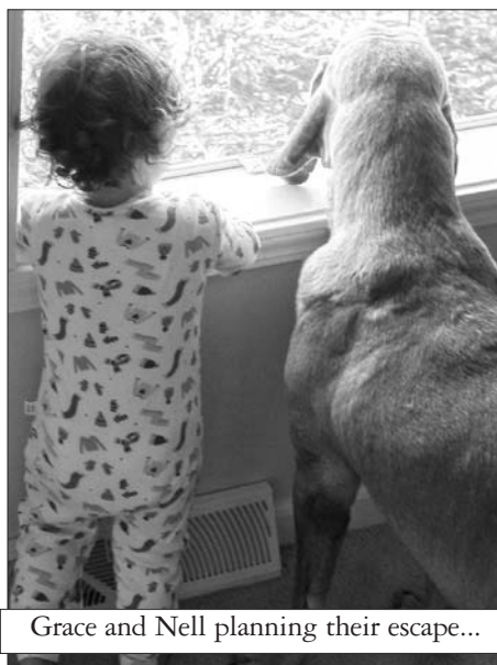
Grace and Nell planning their escape...

Peppertree Rescue, Inc. (A 501 (c) (3) Not-for-Profit Charity)